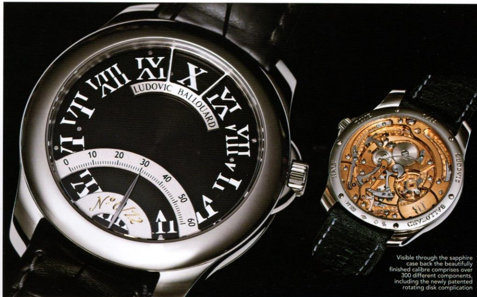
Visible through the sapphire case back the beautifully finished calibre comprises over 300 different components, including the newly patented rotating disk complication

Like its name suggests, the Half-Time watch literally slices each Roman hour numeral in half, and mounts each half on two separate disks. The disks rotate in opposite directions so only the current hour is legible at the top of its dial